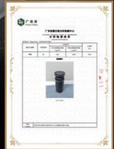
Candida albicans test