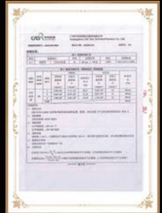
Formaldehyde removal Report